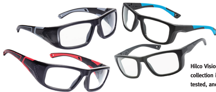
Hilco Vision’s OnGuard safety eyewear collection is designed, developed, tested, and manufactured in the USA.