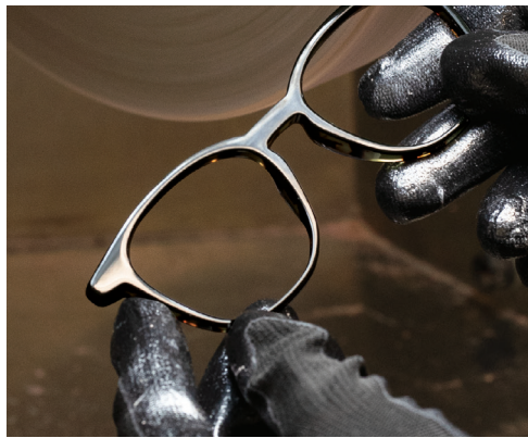
Making more products at home in Marietta, Georgia has resulted in interest and excitement from The McGee Group’s customers.

Like everyone else, The McGee Group’s Georgia team have faced issues brought about by COVID,