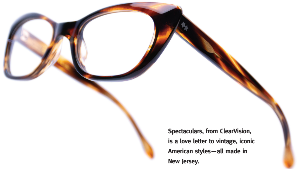
Spectaculars, from ClearVision, is a love letter to vintage, iconic American styles—all made in New Jersey.

"Spectaculars USA is supporting optical independence and building a nationwide network of leading vision care providers offering American-made eyewear," said Friedfeld. "The core aesthetic of the Spectaculars collection has its roots in genuine American eyewear dating back to the '30s. The most iconic and classic American styles are reproduced using the same colors and finishing details as were used in the past...Spectaculars continues to stay true to time-tested production techniques, honoring the original method of American manufacturing and hand-finishing." ■