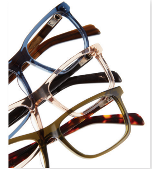
L’Amy America is launching Seven.Five, its American-made collection designed in Connecticut and produced in New Jersey.

“Superior quality, handmade acetates, comfort-sculpted temple design, gorgeously distinctive colorations, and subtle patriotic detail make for a memorable collection.”