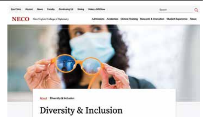
DE&Is a multi-pronged effort at New England College of Optometry.